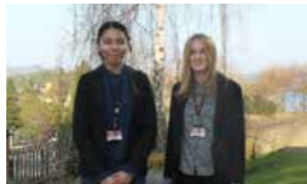
Oxbridge Conditional Offers