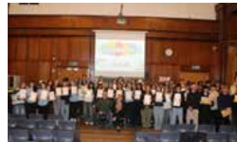
Year 10 Duke of Edinburgh's Awards Ceremony