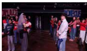
Romeo and Juliet Production